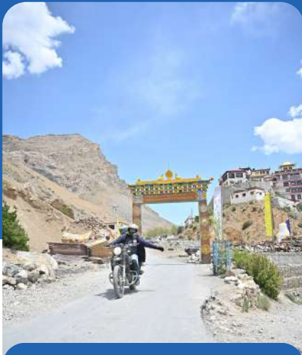
Spiti Bike Expedition

“Better to see something once than hear about it a thousand times.”